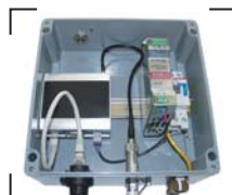
Industrial WiFi solution